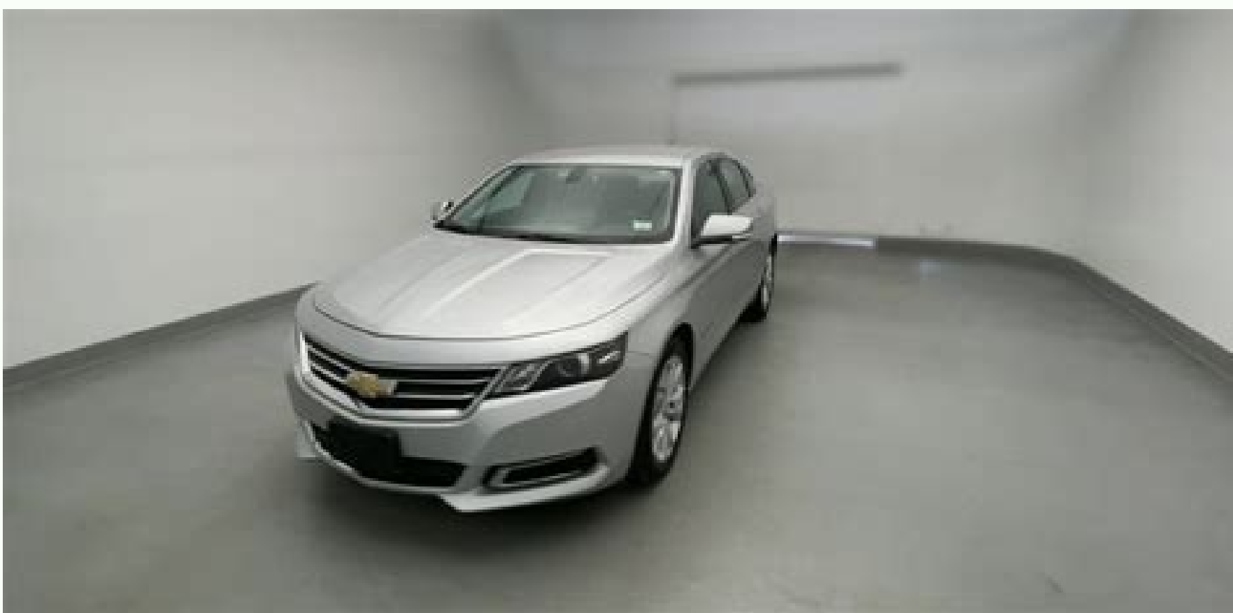
2017 chevy impala premier owners manual.